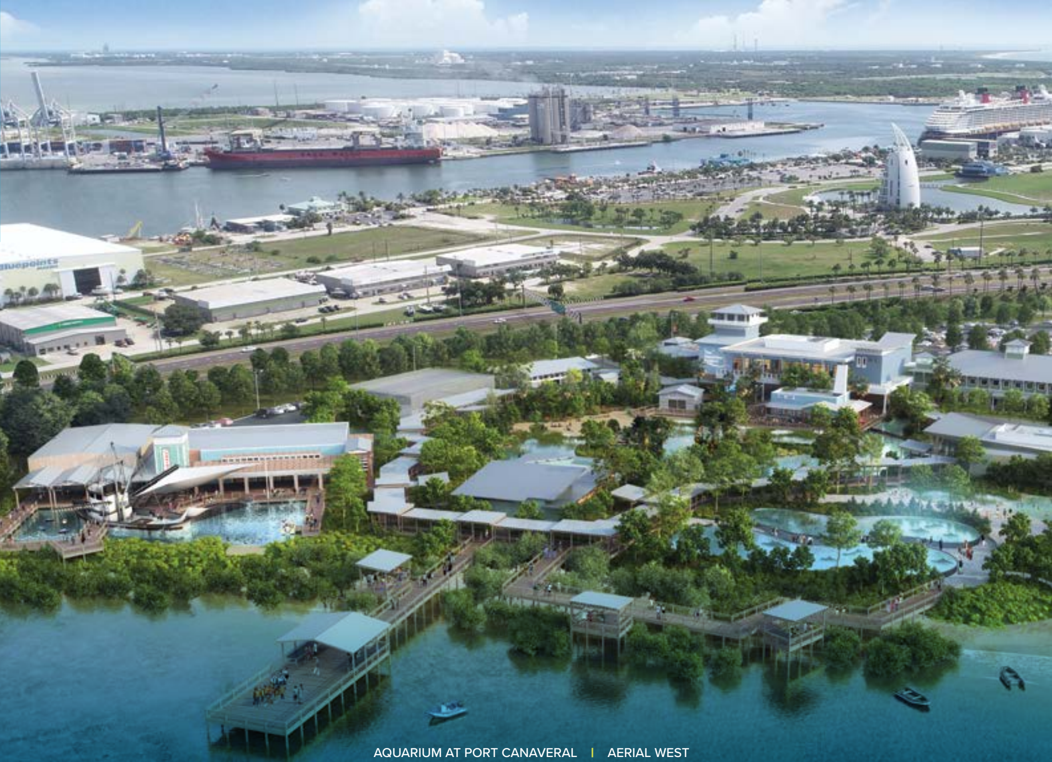
AQUARIUM AT PORT CANAVERAL | AERIAL WEST