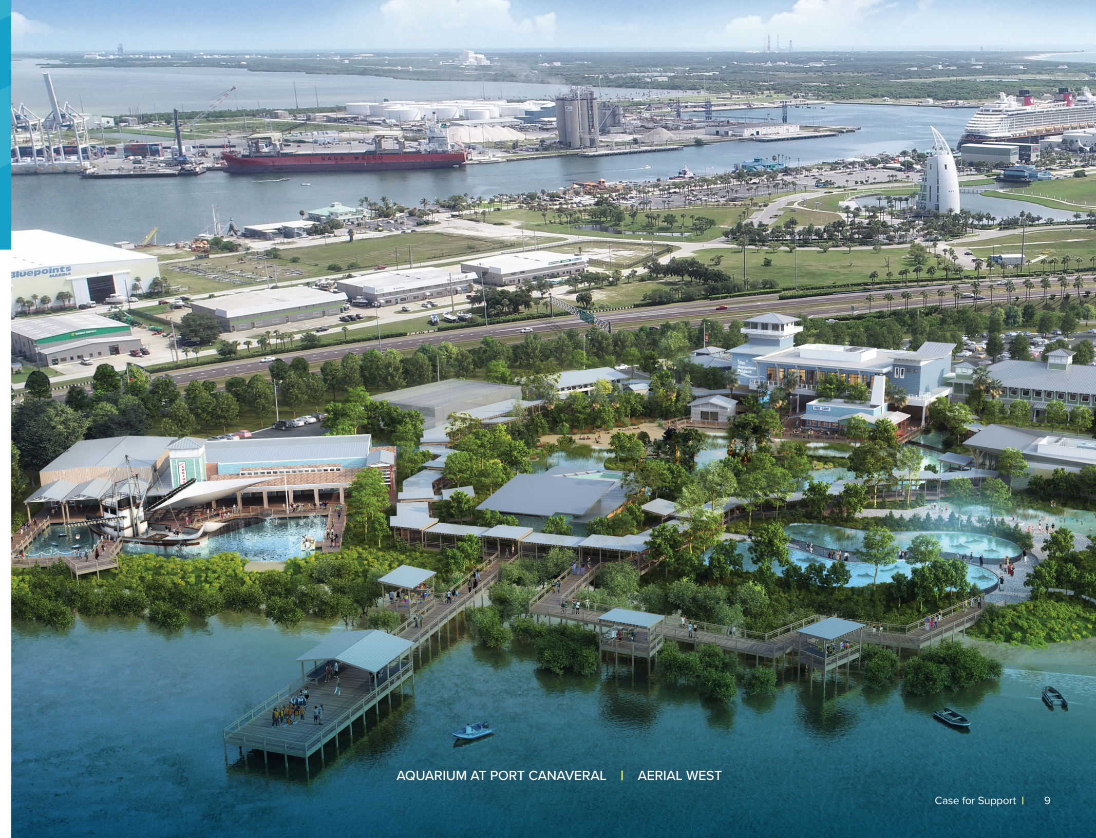
AQUARIUM AT PORT CANAVERAL | AERIAL WEST